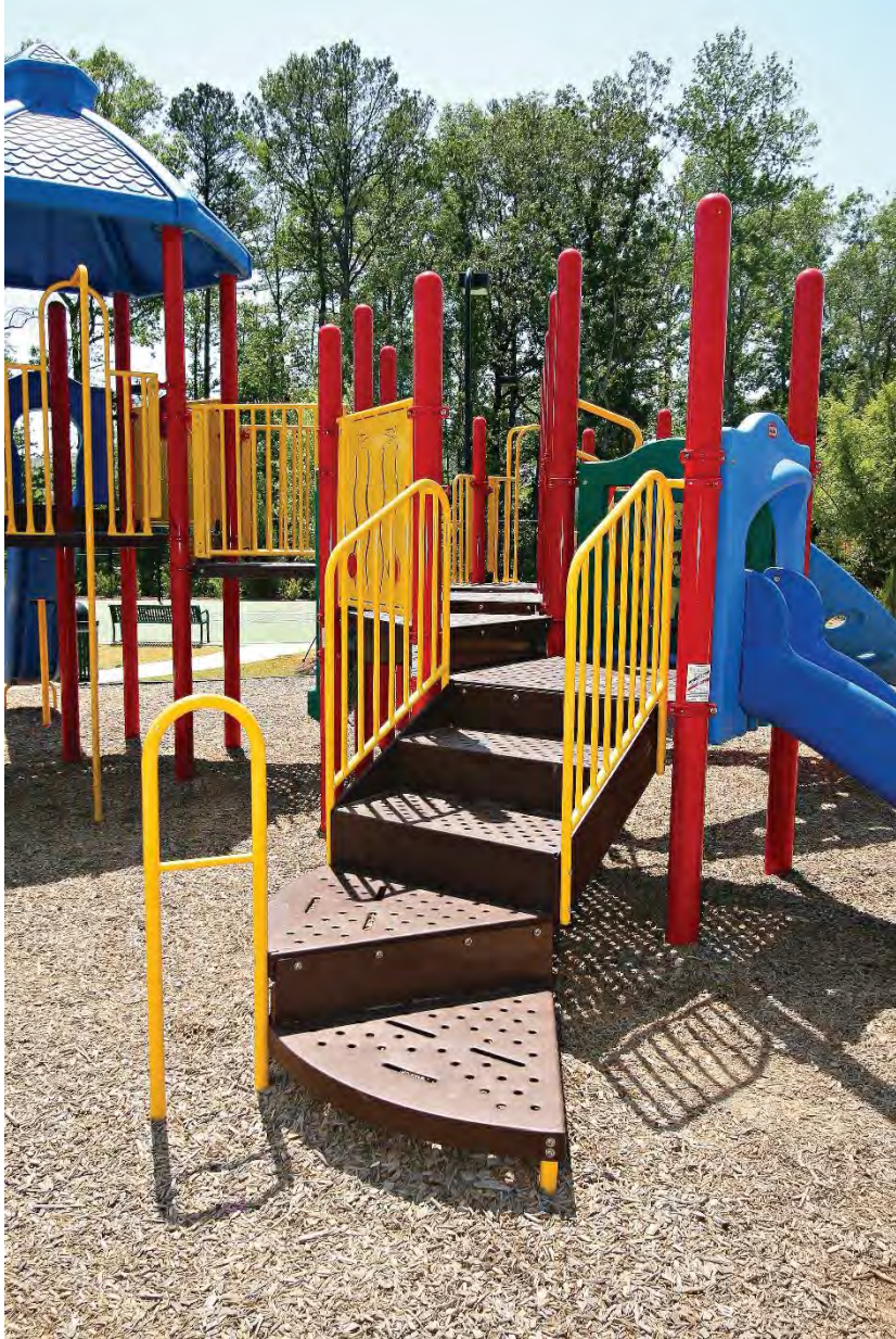
Transfer Station And Elbow slide