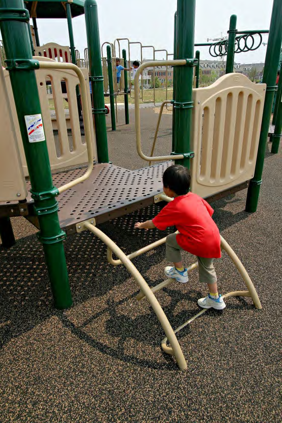
Inverted Arch And Curly Climbers