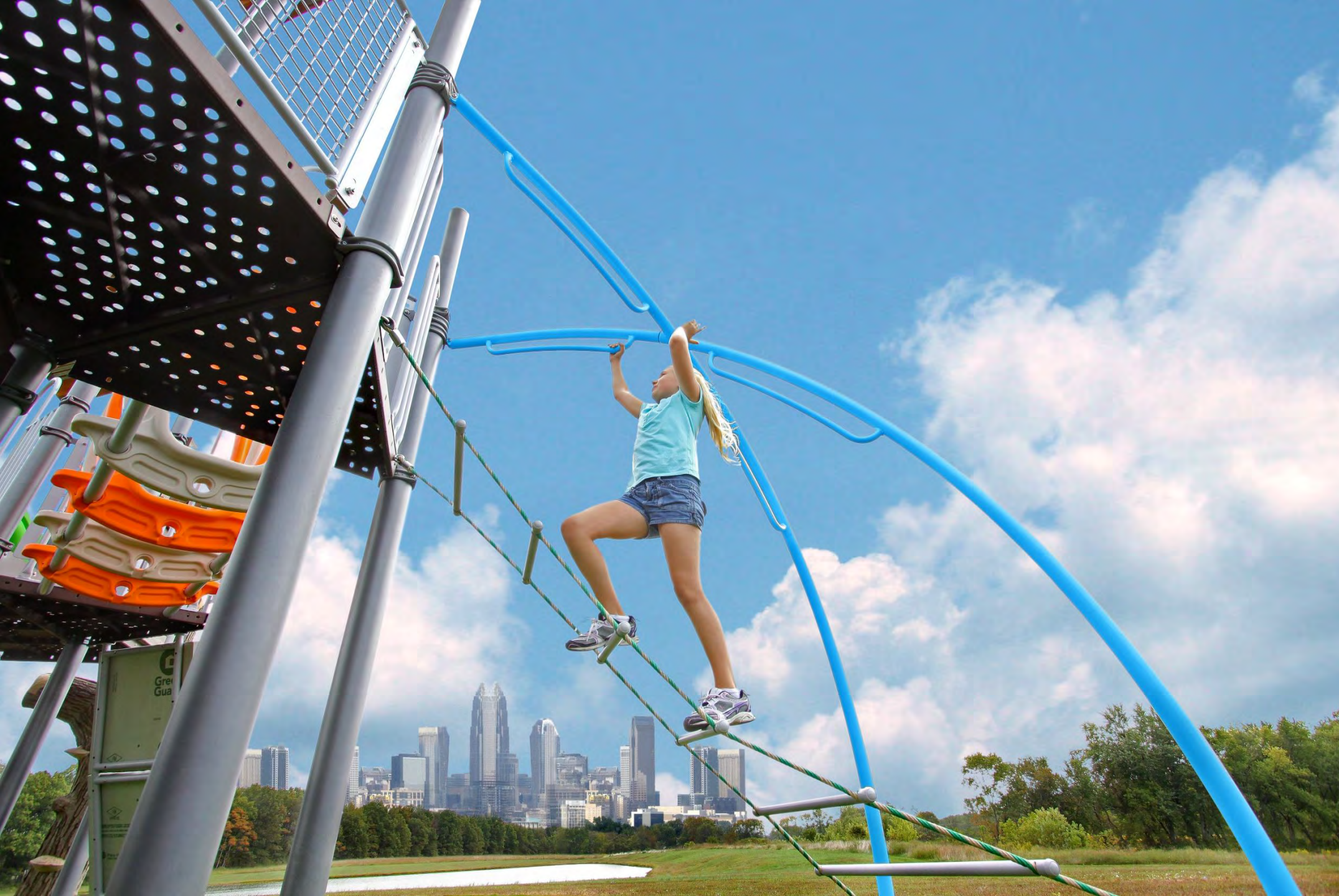
The X Climber