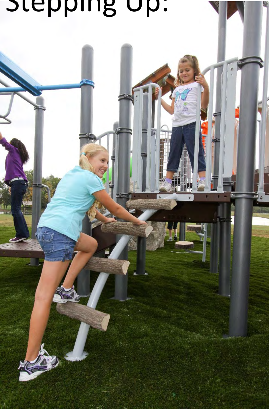
Arched Log Climber And 7 Station Play Factory